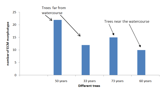
Figure 1: ECM Morphotypic Richness of Populus Nigra (Ait Zikki Station)